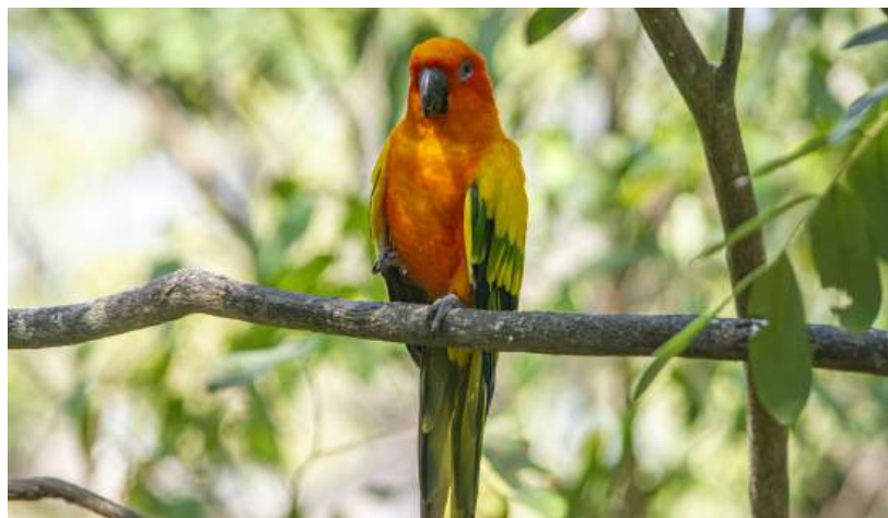
Parrot, Loros Foundation, Villanueva

An expert-led tour takes you through regenerated forest habitats, where you will observe these magnificent birds in their natural environment, learning how the foundation's work combats illegal trafficking and habitat destruction. The experience extends beyond wildlife observation