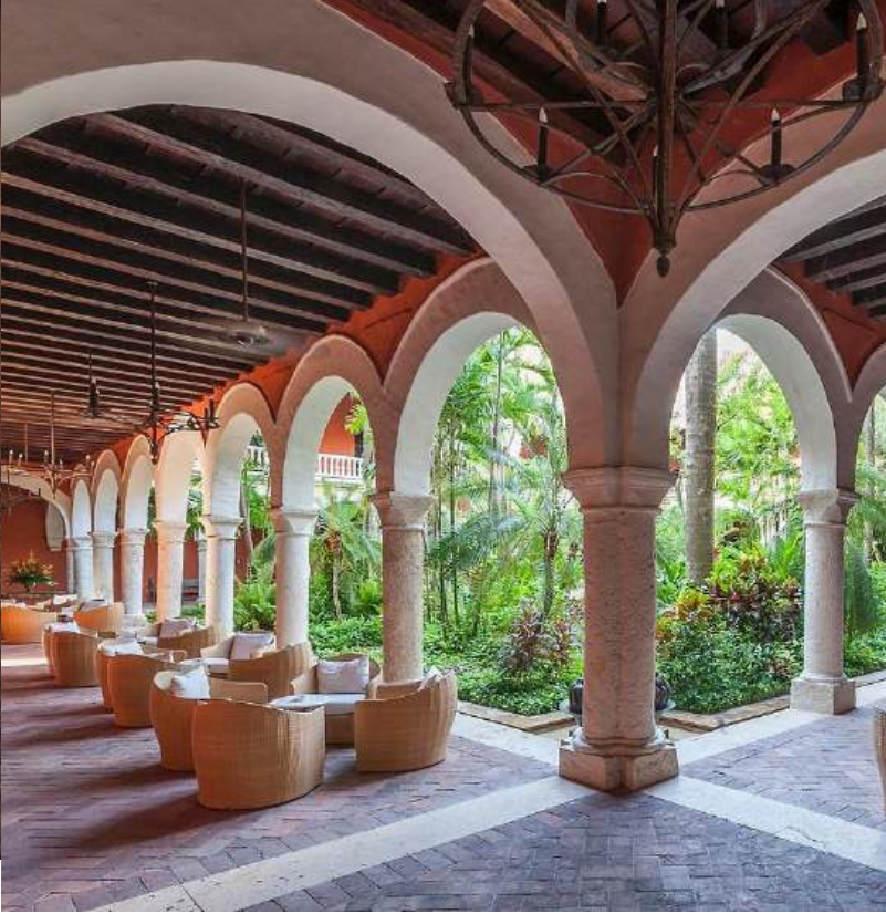
Hotel Sofitel Legend Santa Clara Cartagena