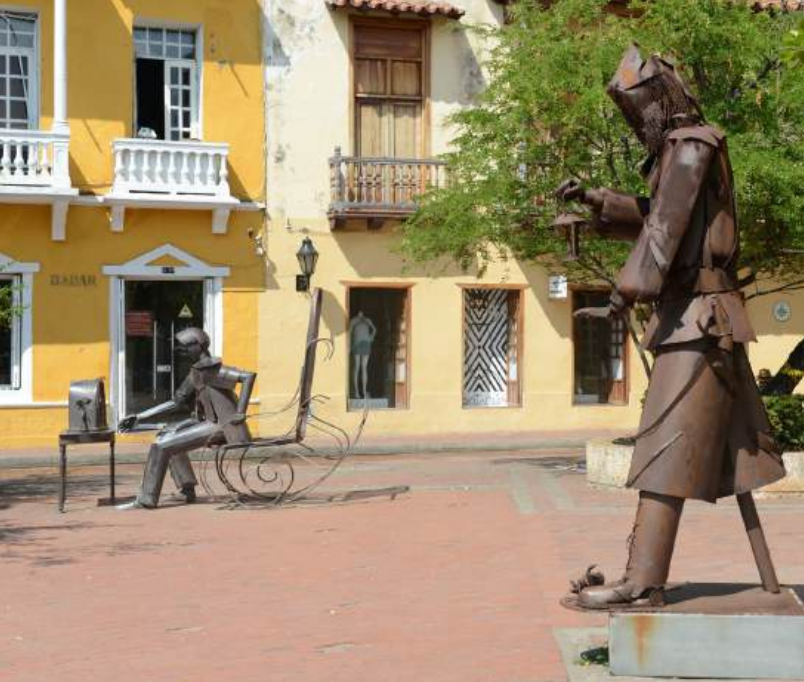
Museo de Arte Moderno, Cartagena

An optional prelude in Medellín will be offered, with dates, details, and pricing to be determined.