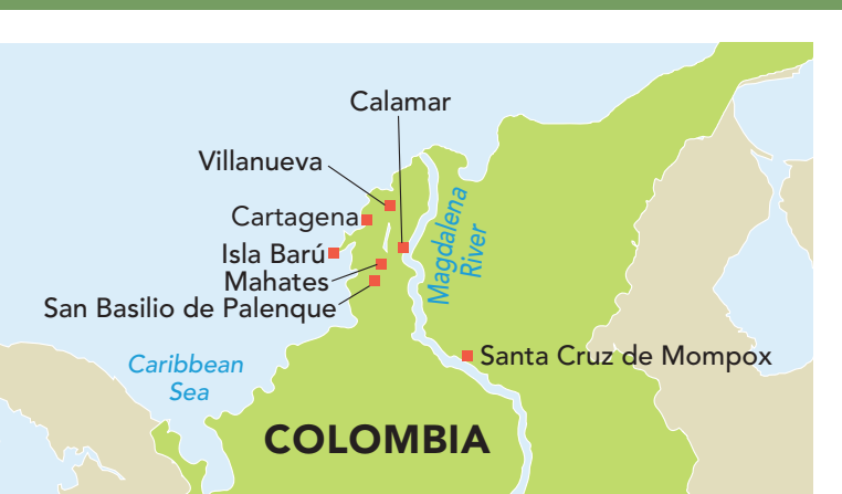
Map of the region (above)