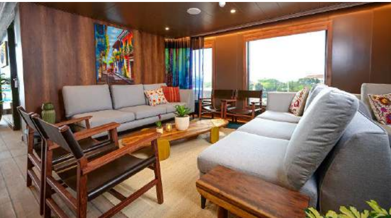
Luxury Suite (top) and Lounge