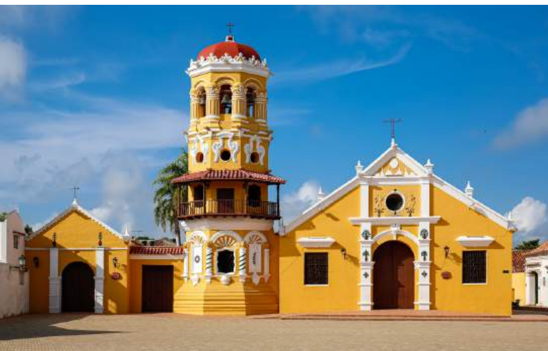
Iglesia de Santa Bárbara, Mompox