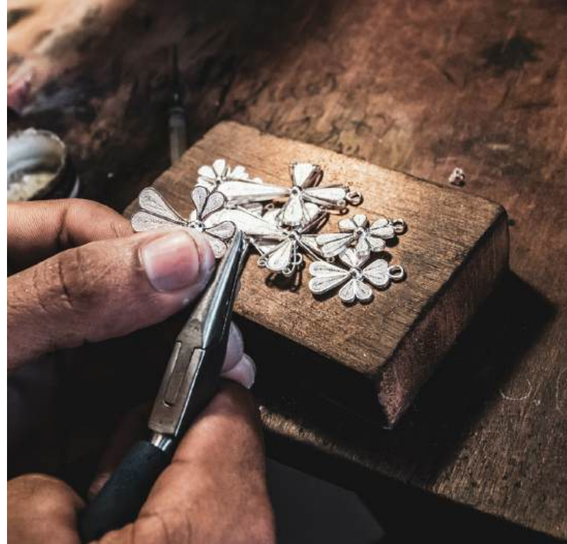
Filigree silver workshop, Mompox

After lunch, join a filigree silver workshop with local