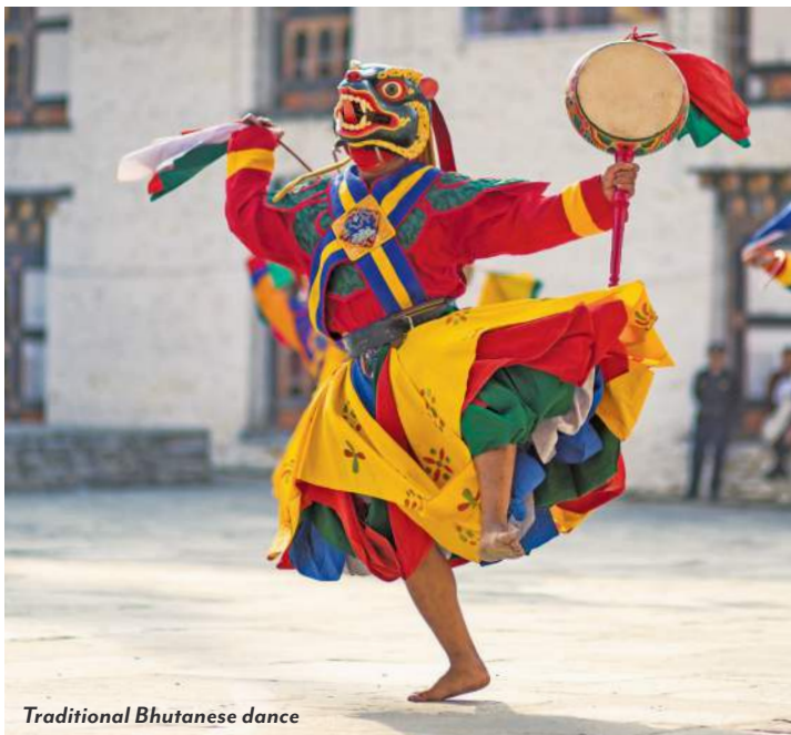
Traditional Bhutanese dance