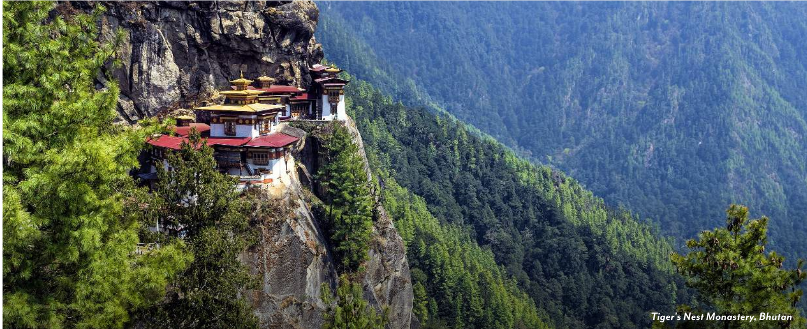
Tiger's Nest Monastery, Bhutan