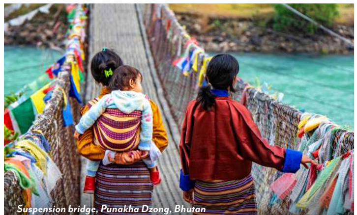
Suspension bridge, Punakha Dzong, Bhutan

April 10 to 14, 2027 | Program Begins: April 12