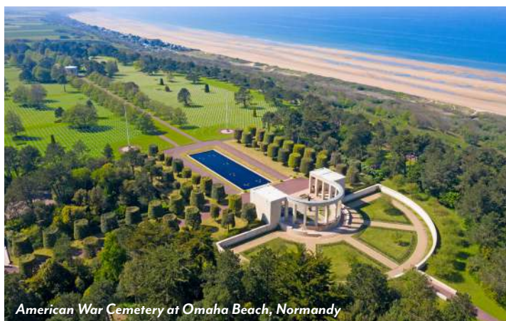
American War Cemetery at Omaha Beach, Normandy