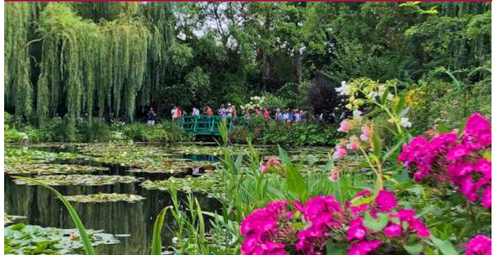
Paris and Giverny | 4 days, 3 nights City Tour | Monet's Gardens