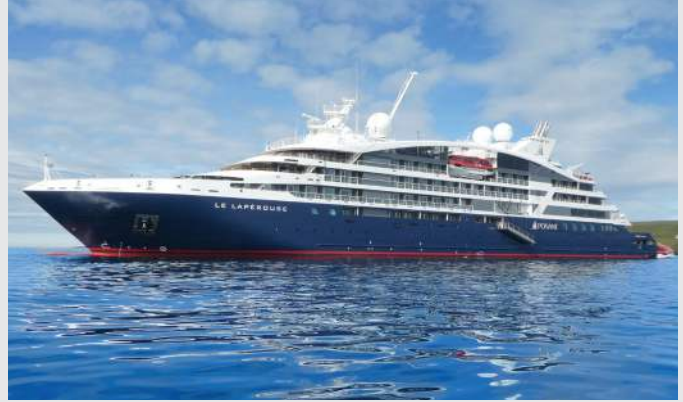
Le Laperouse Exclusively Chartered, Deluxe Small Ship