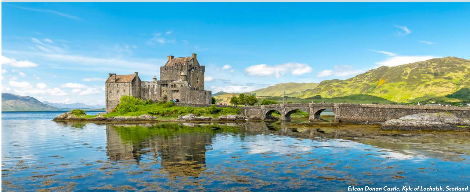
Eilean Donan Castle, Kyle of Lochalsh, Scotland