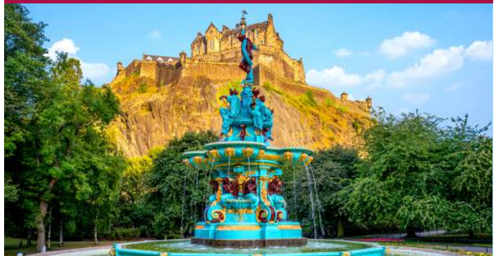
Glasgow and Edinburgh | 4 days, 3 nights Kelvingrove Art Gallery & Museum | Edinburgh City Tour