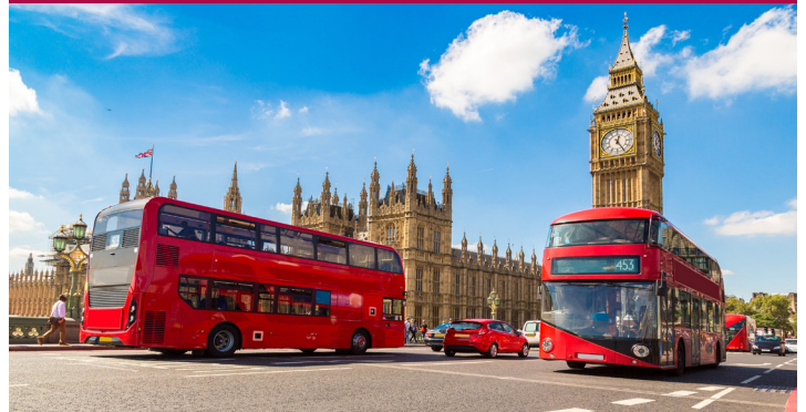
London | 3 days, 2 nights May 11 to 13, 2027 | Program Ends: May 13

All Program Features are contingent upon final brochure pricing. 2027