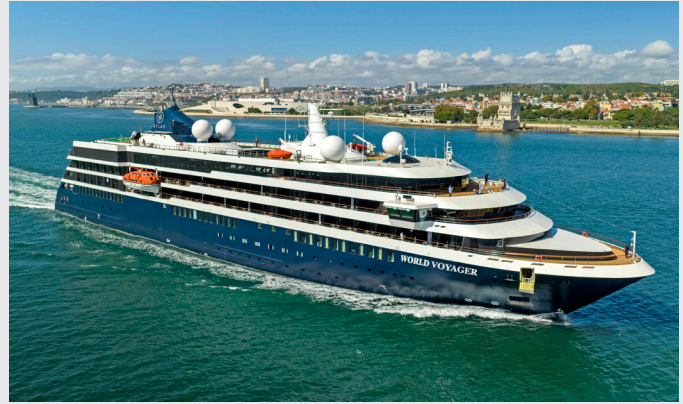
World Voyager Exclusively Chartered, Deluxe Small Ship