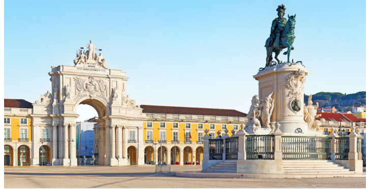
Lisbon | 4 days, 3 nights April 30 to May 3, 2027 | Program Begins: May 1