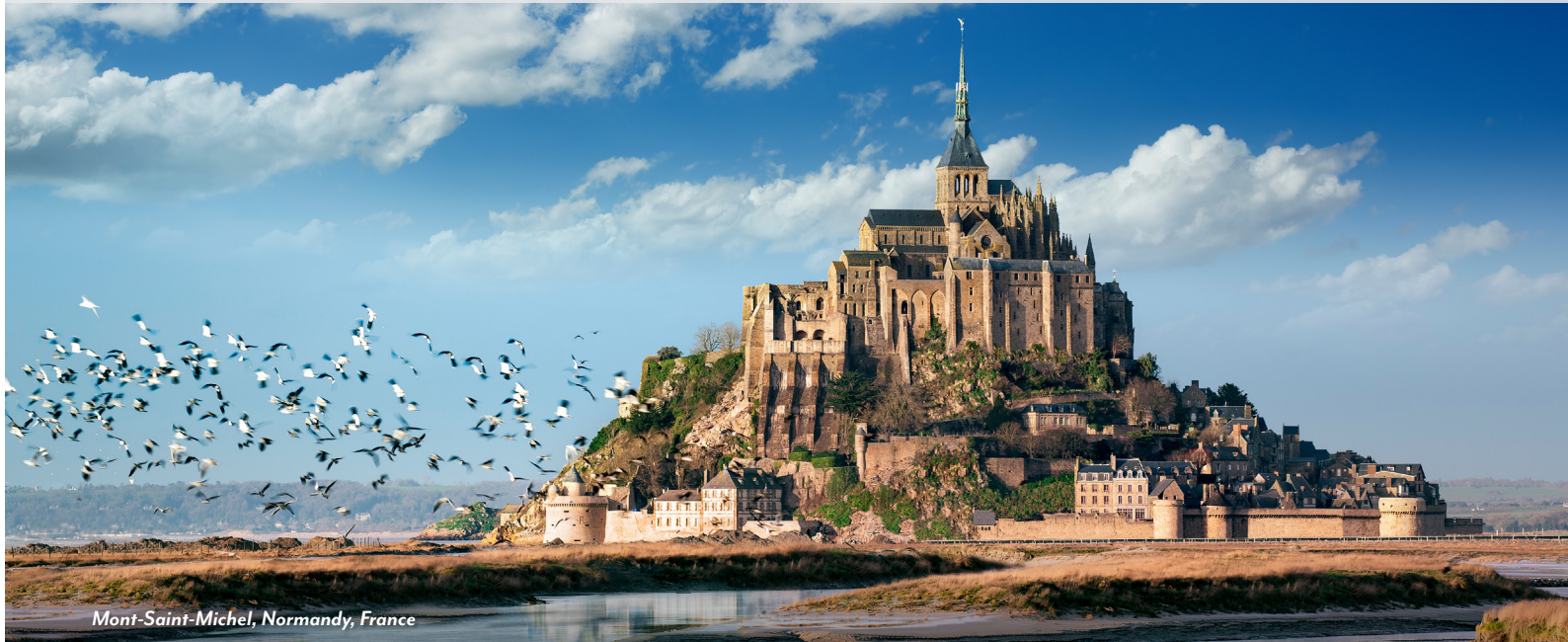
Mont-Saint-Michel, Normandy, France