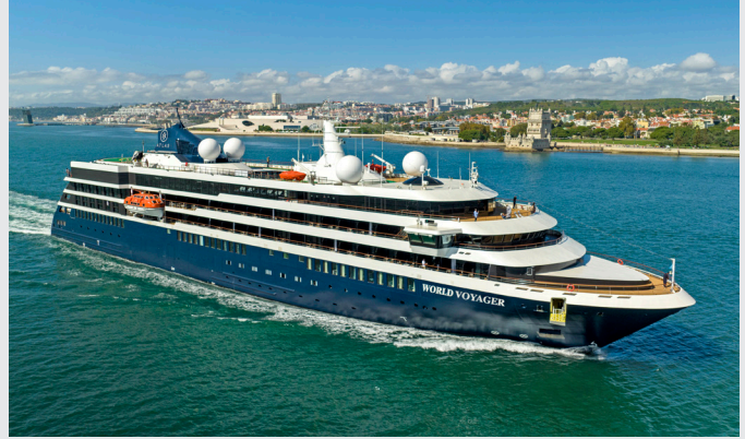
World Voyager Exclusively Chartered, Deluxe Small Ship