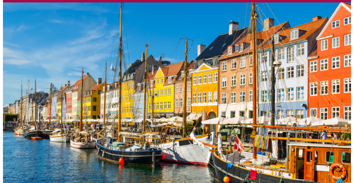
Norway and Copenhagen | 6 days, 5 nights Voss-to-Oslo Train | Oslo & Copenhagen Tours