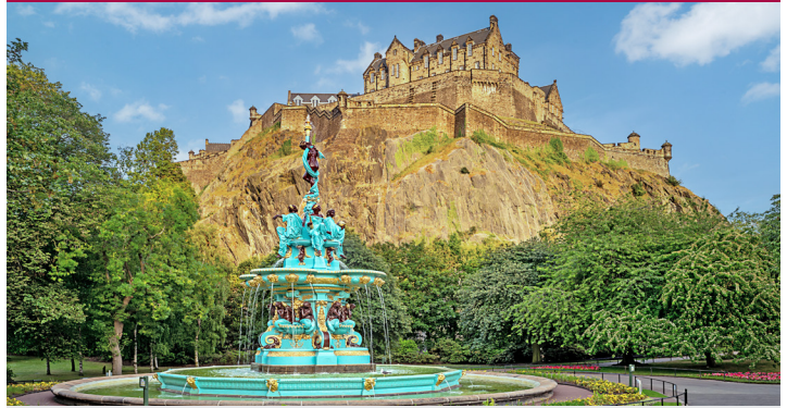
Edinburgh and Glasgow | 5 days, 4 nights Edinburgh & Stirling Castles | Glasgow