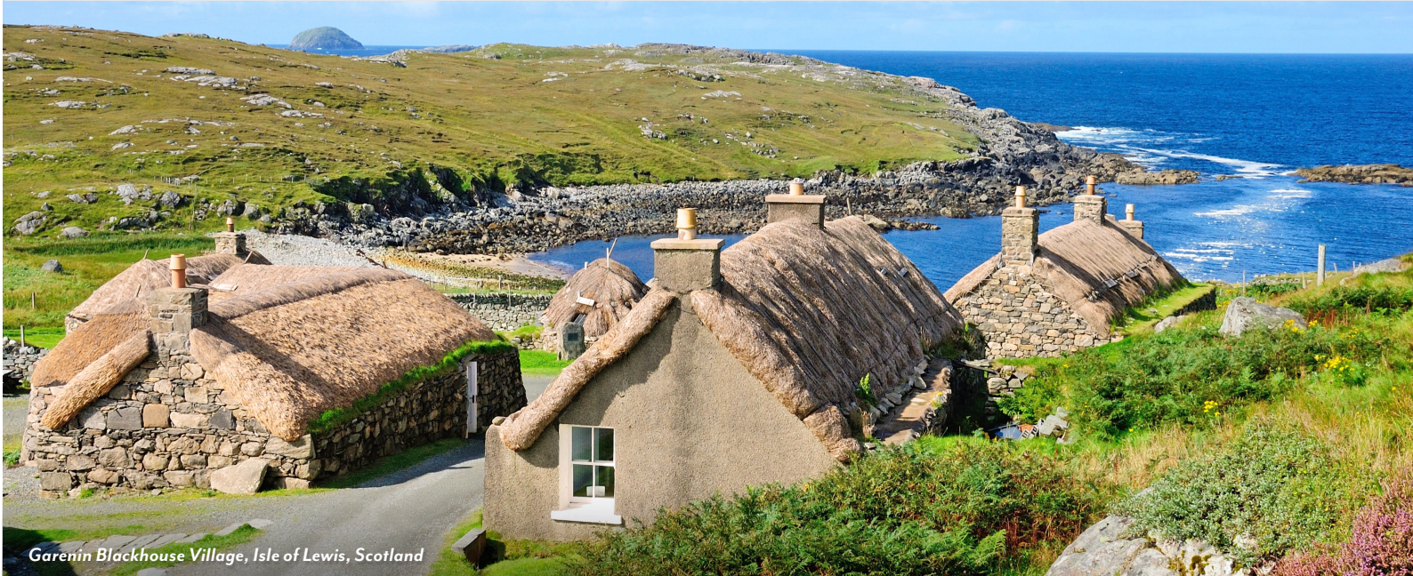
Garenin Blackhouse Village, Isle of Lewis, Scotland