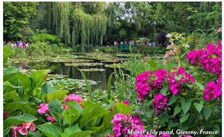
Monet's lily pond, Giverny, France