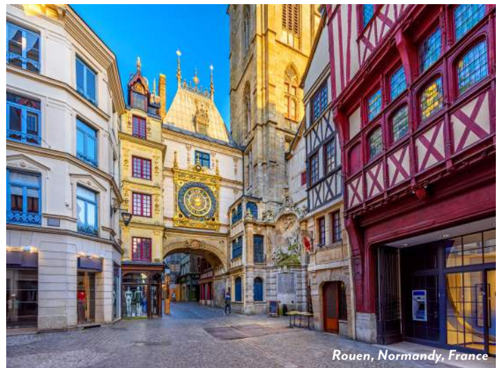
Rouen, Normandy, France