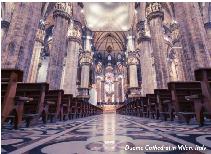
Duomo Cathedral in Milan, Italy