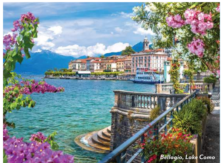
Bellagio, Lake Como