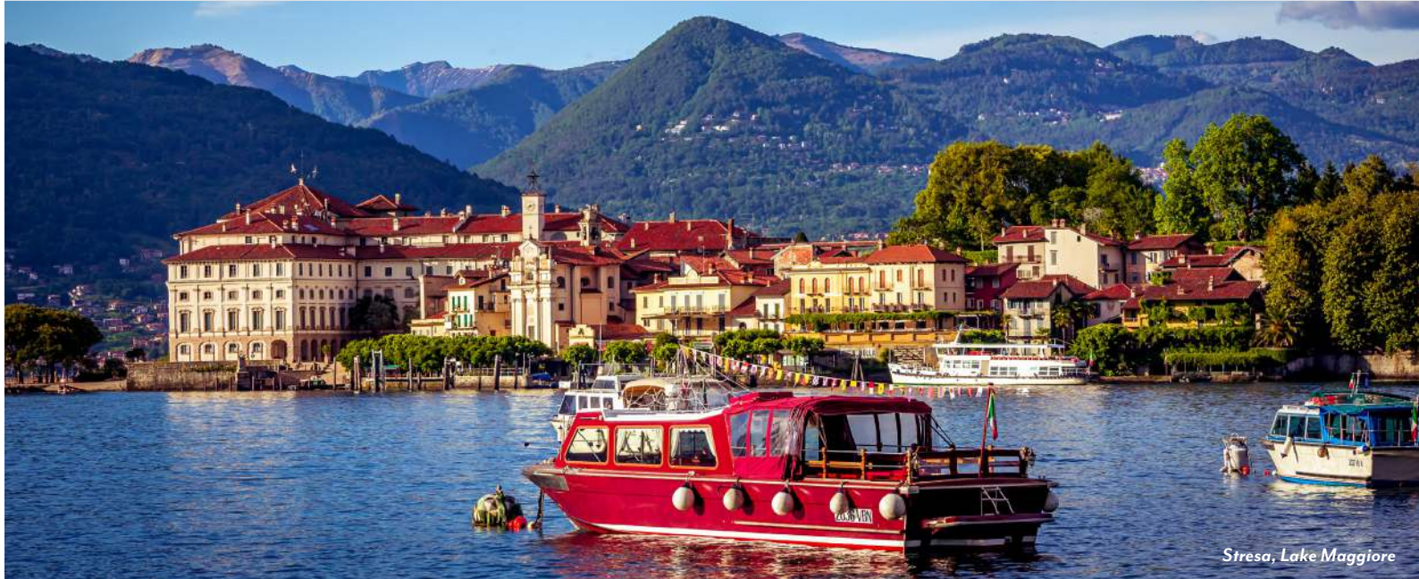
Stresa, Lake Maggiore