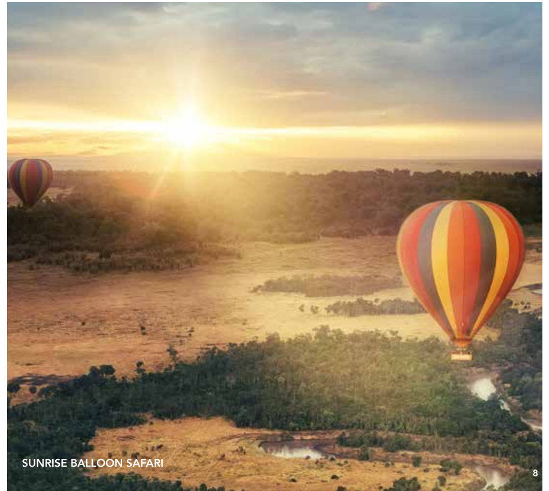
SUNRISE BALLOON SAFARI