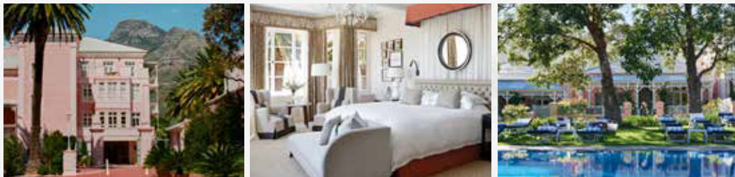
MOUNT NELSON HOTEL BY BELMOND