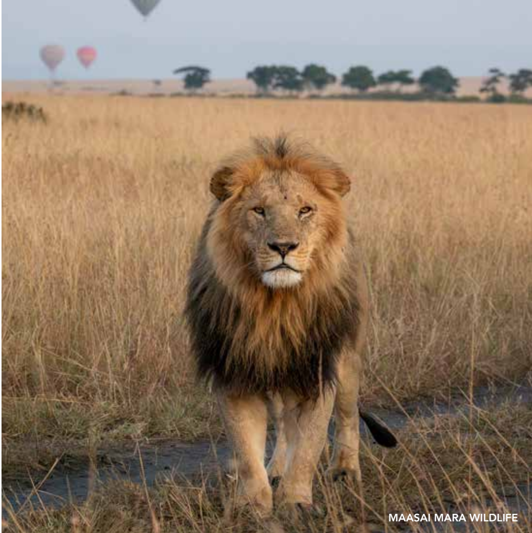
MAASAI MARA WILDLIFE