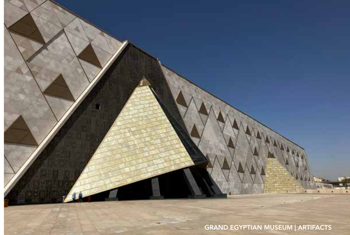
GRAND EGYPTIAN MUSEUM | ARTIFACTS