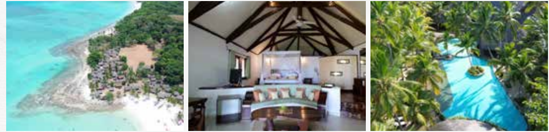
RAVINTSARA WELLNESS HOTEL