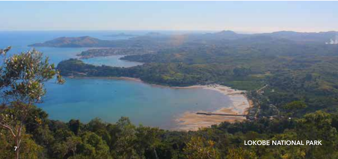
LOKOBÉ NATIONAL PARK