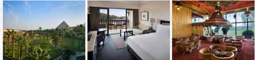
MARRIOTT MENA HOUSE – CAIRO