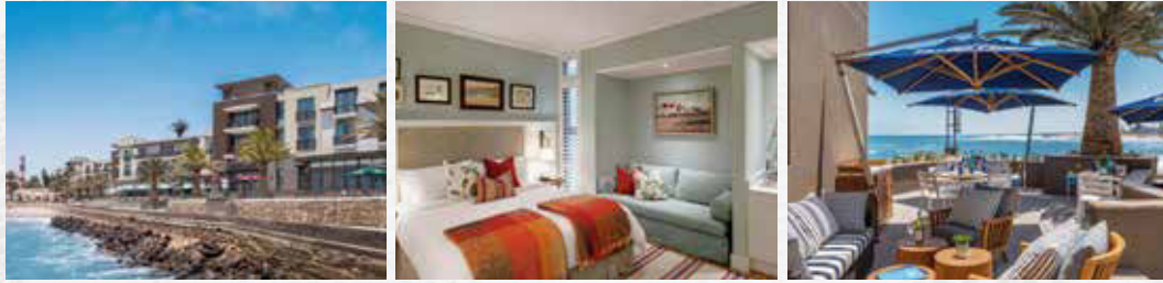
STRAND HOTEL SWAKOPMUND