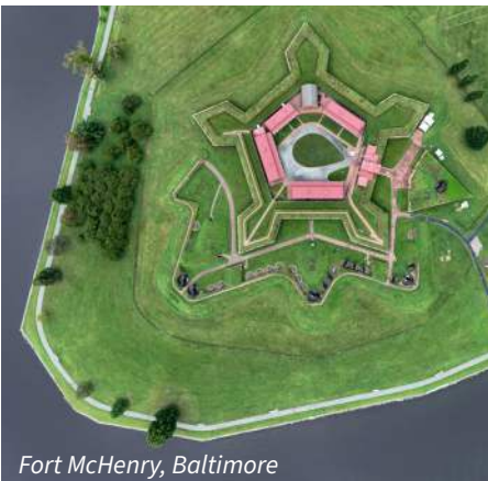
Fort McHenry, Baltimore

After breakfast on board, disembark and transfer to Baltimore/Washington International Airport (BWI) for flights homeward. Baltimore offers a fitting finale to your journey, known for its proud maritime heritage and vibrant neighborhoods. The city’s Inner Harbor is home to historic ships, engaging museums, and the acclaimed National Aquarium. Nearby, Fort McHenry stands as the birthplace of “The Star-Spangled Banner,” while the cobbled streets of Fells Point and Mount Vernon reveal Baltimore’s enduring character, where history, art, and culture meet the charm of the Chesapeake. (B)