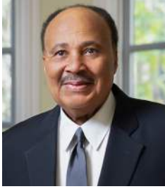
Martin Luther King III