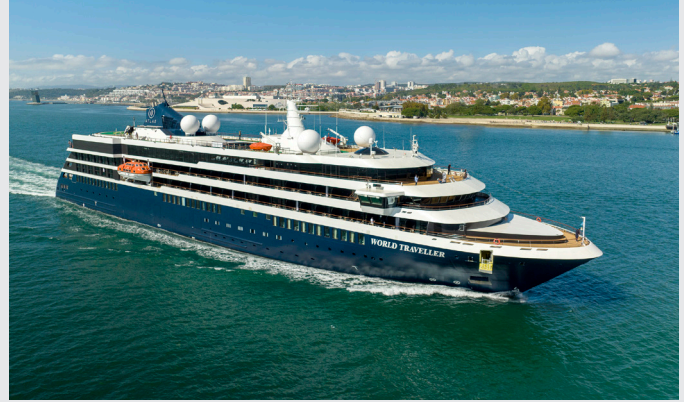
World Traveller Exclusively Chartered, Deluxe Small Ship