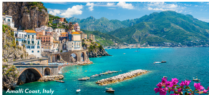
Amalfi Coast, Italy

Elevate your experience with a selection of included excursions. Join the excursion of your choice in the following locations: —Livorno: Tour Lucca with a visit to Villa Reale di Marlia, or tour Florence with a visit to the Galleria dell'Accademia.