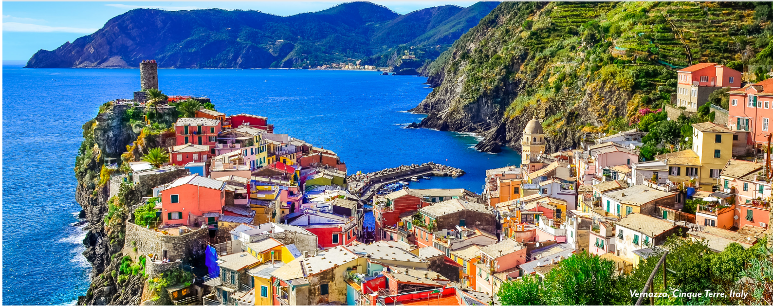
Vernazza, Cinque Terre, Italy