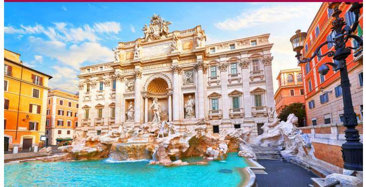
Rome | 4 days, 3 nights May 28 to 31, 2027 | Program Begins: May 29