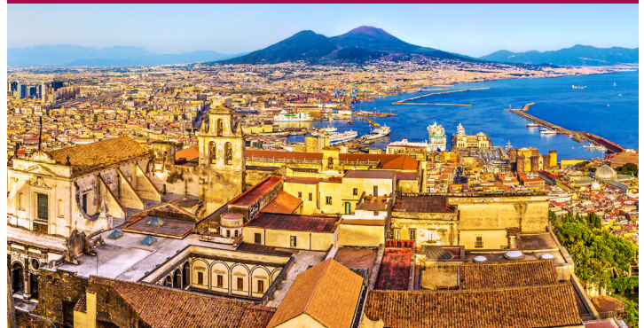
Naples | 3 days, 2 nights June 7 to 9, 2027 | Program Ends: June 9