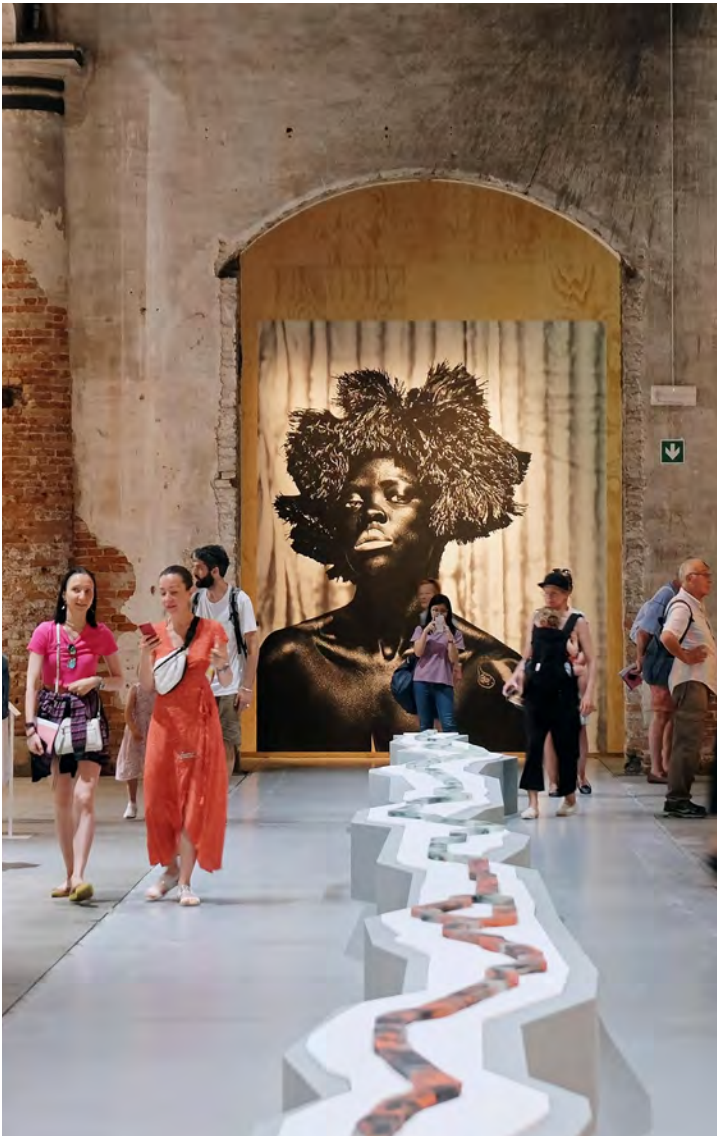
May You Live In Interesting Times, 59th Venice Biennale, 2019

Today, the Arsenale's cavernous historic boathouses and ropewalks have been repurposed as a primary exhibition space for the Biennale. After experiencing the exhibits and free time for lunch, the afternoon is at your leisure.