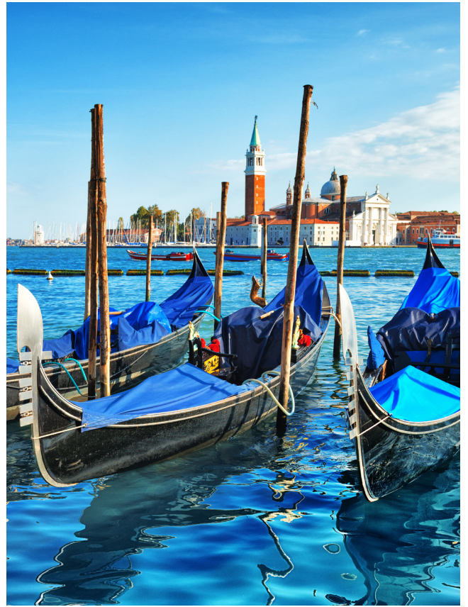
Gondolas, Grand Canal