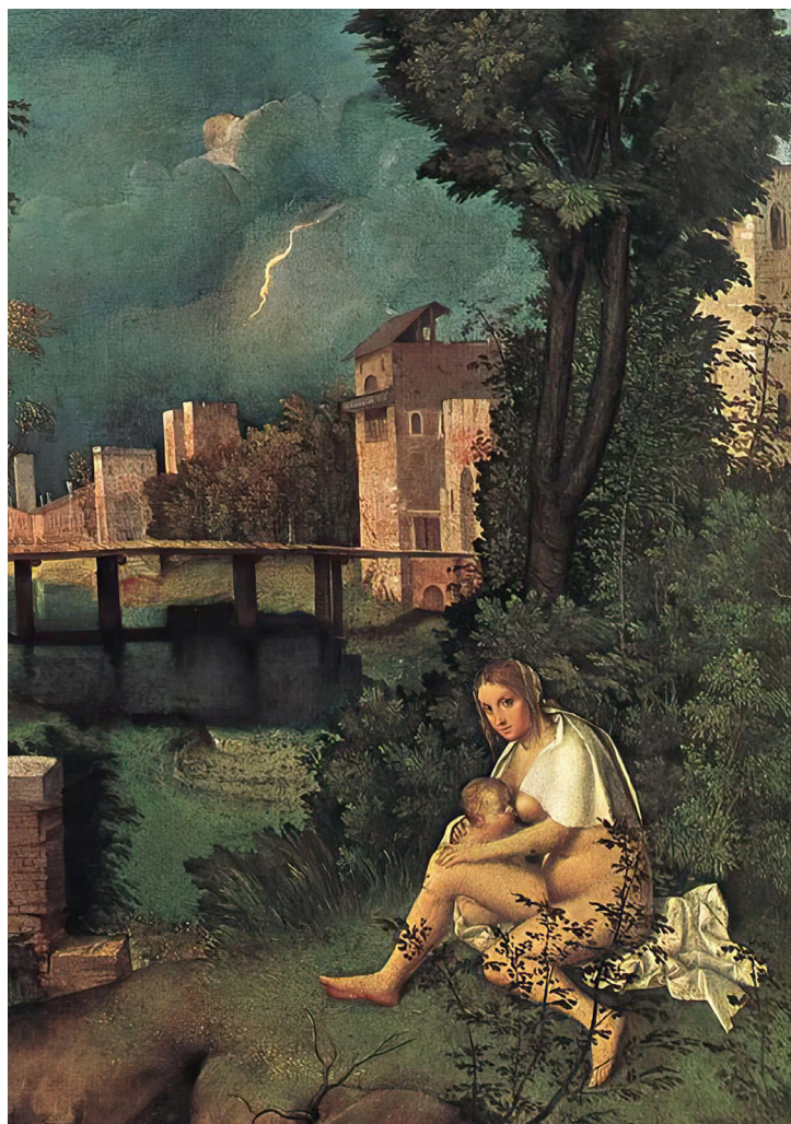
Giorgione, The Tempest (detail), 1508, Gallerie dell'Accademia

© 2026 Arrangements Abroad, Inc. All Rights Reserved.