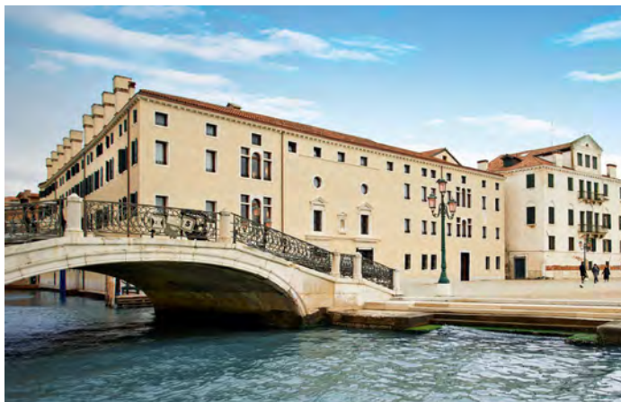
Ca' di Dio, Venice