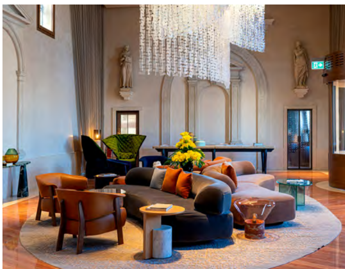
Ca' di Dio, Venice rooftop (top) and lounge (above)