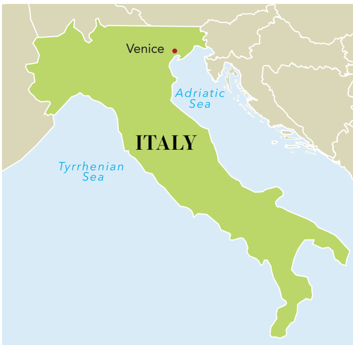
Map of the region

A guided tour introduces us to Venice's singular urban layout, a city of 118 islands connected by man-made canals. Afterwards, we will be initiated into a cherished local ritual at a bacaro , one of the city's traditional wine bars. Here, we will taste cicchetti , Venice's answer to tapas , perhaps sampling classics like baccalà mantecato (whipped salt cod) or sarde in saor (sweet and sour sardines).