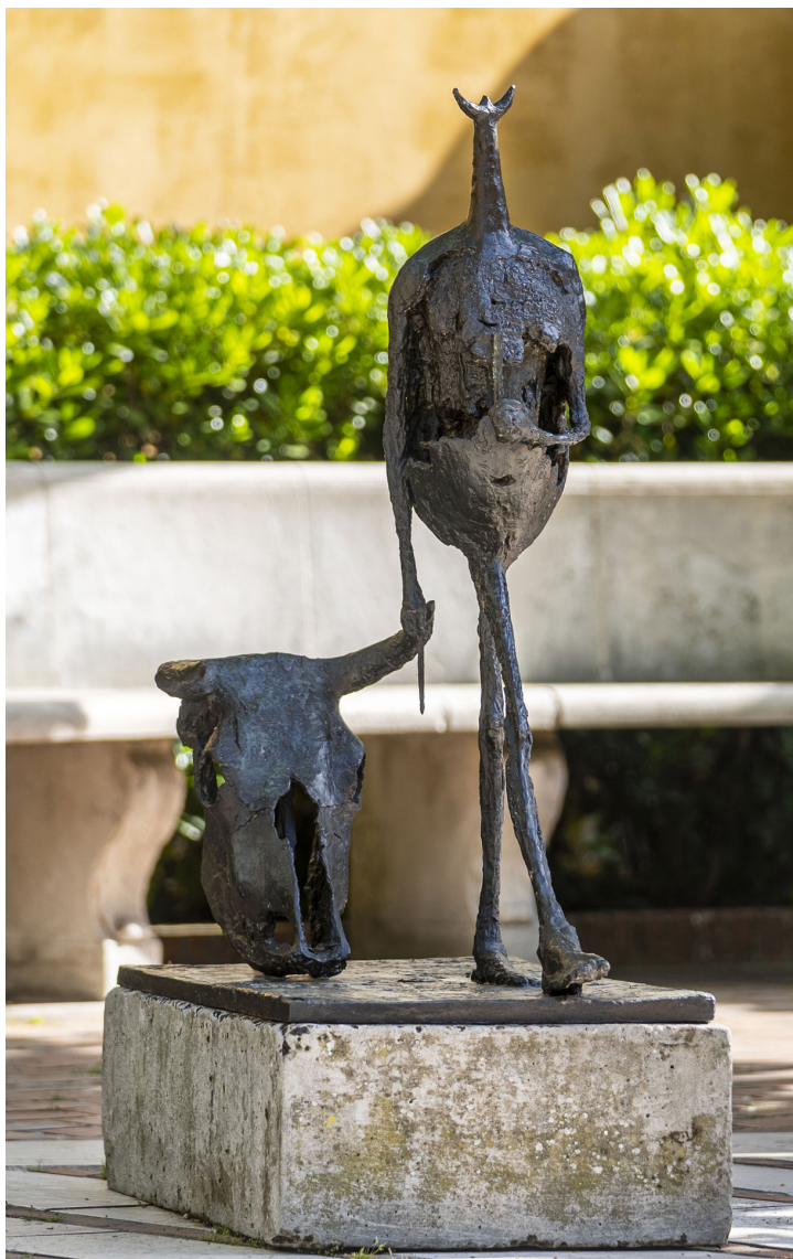
Germaine Richier, Tauromachy , 1953, Peggy Guggenheim Collection, photo © Peggy Guggenheim Collection / Matteo De Fina

After breakfast, transfer to the Venice airport for your flight home. B