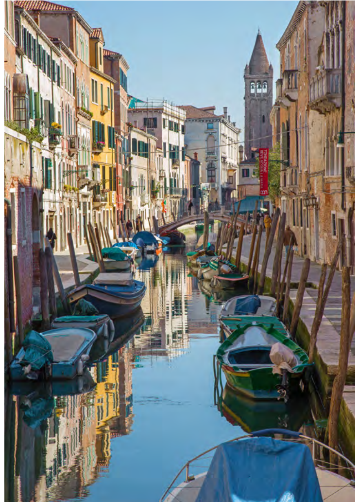
Canal to the Giardini

This afternoon, we will enjoy an exclusive visit to a historic Venetian palace and its private art collection in the company of the owner. A group dinner is planned for this evening. B,L,D