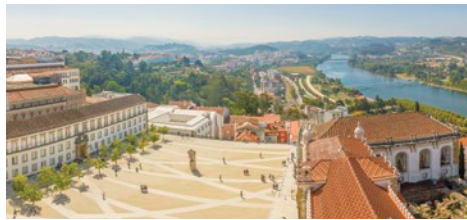
University of Coimbra