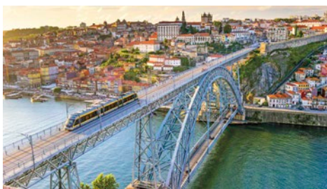
Top: Douro Valley | Above: Porto