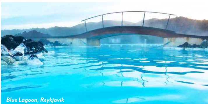
Blue Lagoon, Reykjavik