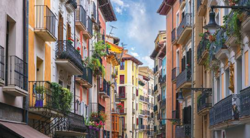
Old Quarter, Pamplona