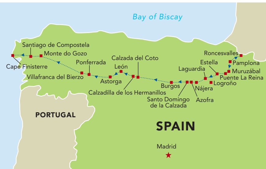
León Cathedral, León (top) and map of the region (above)