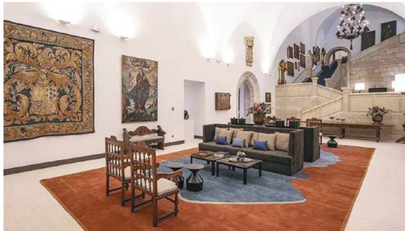
Hotel Villa de Laguardia, Laguardia (top) and Parador de León, León (above)