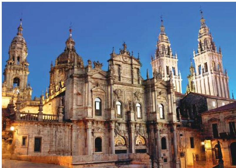
Cathedral of Santiago de Compostela

Depart the hotel and transfer to the Santiago de Compostela airport early this morning for the flight home with a connection through Madrid. B