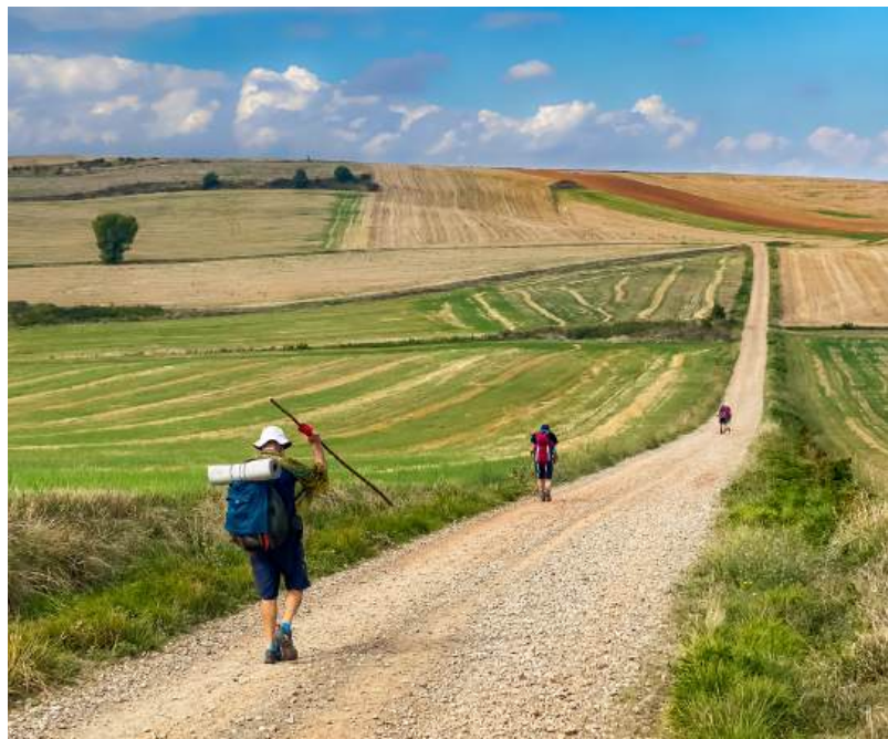
Pilgrims walking El Camino de Santiago trail

Today's journey on the Camino ventures into the glorious open countryside of the páramo (treeless grassland) with its rich red earth. Drive to Astorga , the crossroads of several major pilgrim routes. Admire Gaudí's Bishop's Palace , which features a museum devoted to the pilgrimage, before lunch at leisure.