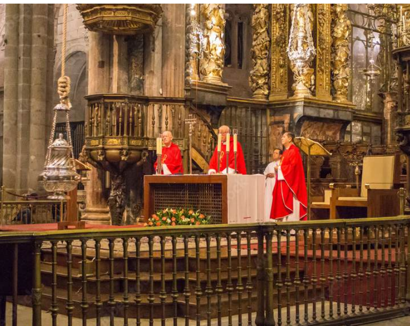
Botafumeiro ritual, Santiago de Compostela

A morning walking tour includes the highlights of this UNESCO-listed historic town, which is the final destination of the Camino. Complete the pilgrim experience at the majestic cathedral's noon Mass , where you will witness the famous Botafumeiro ritual, in which a massive censer swings high above the cathedral's nave, operated by eight tiraboleiros . Crafted in 1851, the five-foot-tall, 120-pound golden Botafumeiro ranks among the largest censers globally.