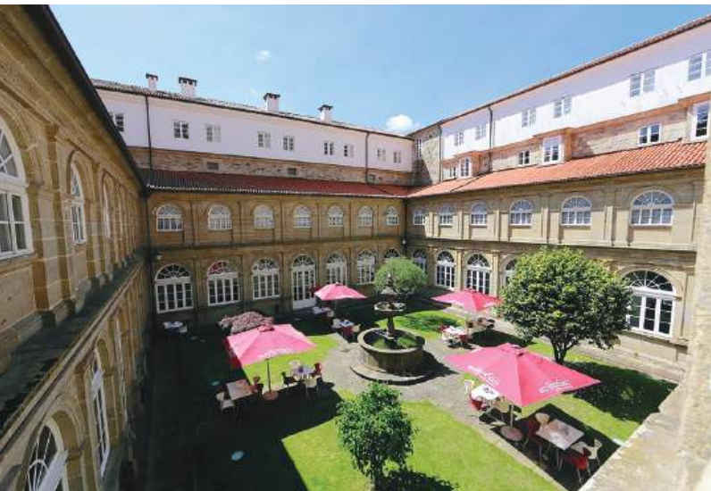
San Francisco Hotel Monumento, Santiago de Compostela