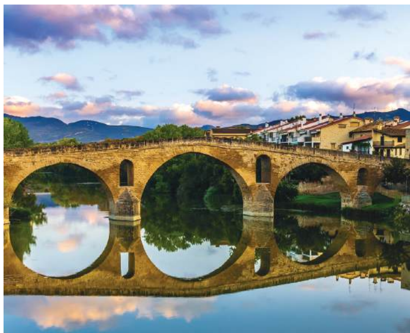
Puente La Reina

Continue walking on the Camino to Azofra , then drive to Santo Domingo de la Calzada for lunch and a visit to the cathedral and the 12th-century Pilgrims' Hospital , now a hostel for pilgrims situated among its network of medieval streets.