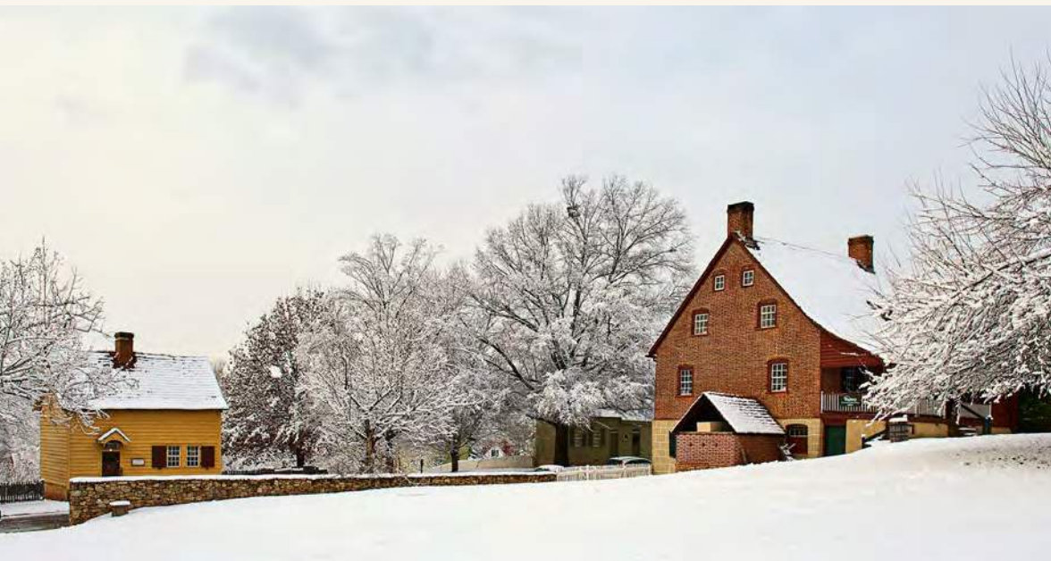
Old Salem in Winter

Head to Home Creek Living Historical Farm for a glimpse of farm life in North Carolina's northwestern Piedmont circa 1900. Be treated to a special tour of the farm and a delicious apple tasting at the Southern Heritage Apple Orchard. Once the Hauser family farm, the property includes the original farmhouse, a tobacco curing barn, a corn crib, cultivated fields, and one of the world's most significant heritage apple orchards, preserving more than 425 varieties of historic Southern apples—many on the brink of extinction. These rare varieties have been carefully tracked down and collected across the South by dedicated "apple hunters," helping safeguard a unique and flavorful piece