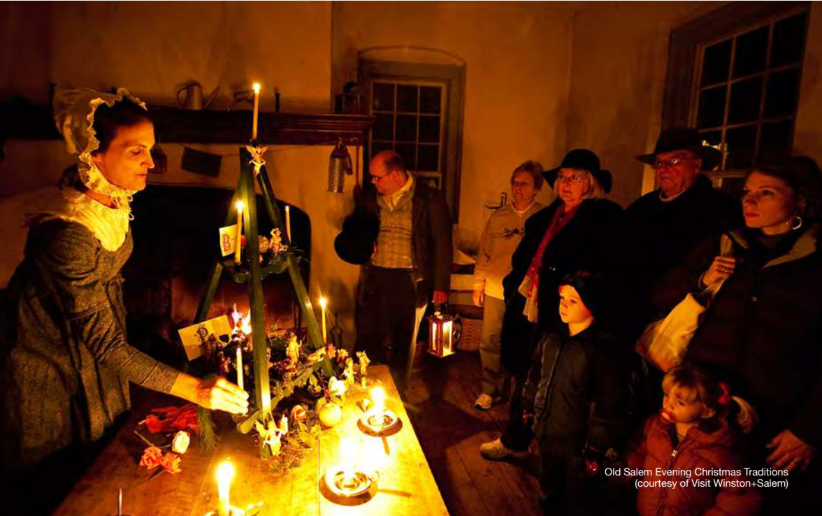
Old Salem Evening Christmas Traditions

Join a morning group airport transfer to Charlotte International Airport (CLT) to meet your return flight home. (Breakfast)