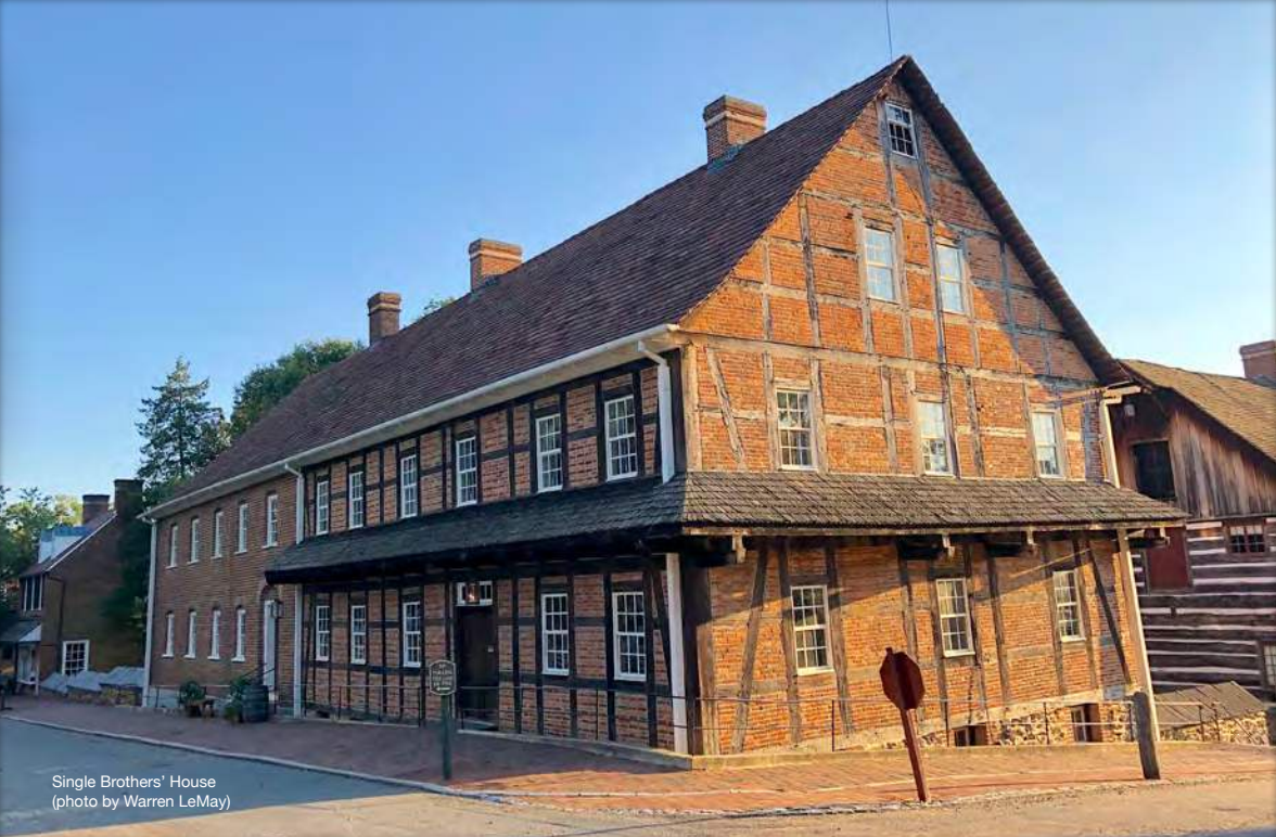
Single Brothers' House