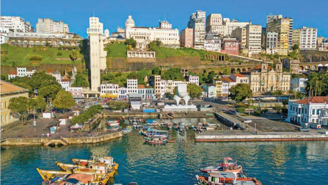
Upper and lower towns of Salvador

Free Time: Enjoy time to explore on your own. Join a festive group dinner in Santa Teresa.