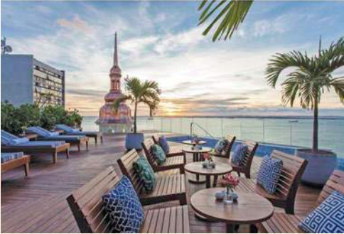
Fera Palace Hotel | Salvador

Our experts have carefully selected these hotels for their prime locations and amenities. In Rio de Janeiro, the first-class Grand Mercure is near the city's landmarks and just steps away from iconic Copacabana beach. The deluxe Fera Palace is in the heart of Salvador. Its authentic art deco styling with modern flourishes welcome guests to the public areas. Enjoy friendly service and inviting, well-appointed guest rooms at both hotels. Complimentary Wi-Fi also is available.