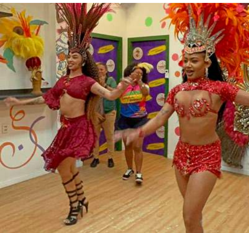
Samba school, Rio

Free Time: Enjoy an afternoon at leisure.