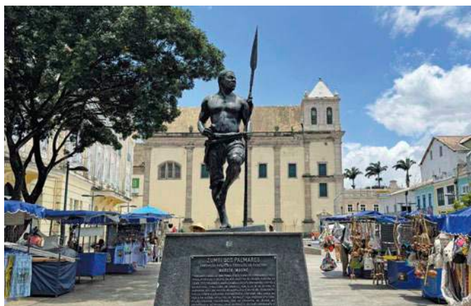
Above: Zumbi dos Palmares monument, Salvador | Below: Santa Teresa, Rio