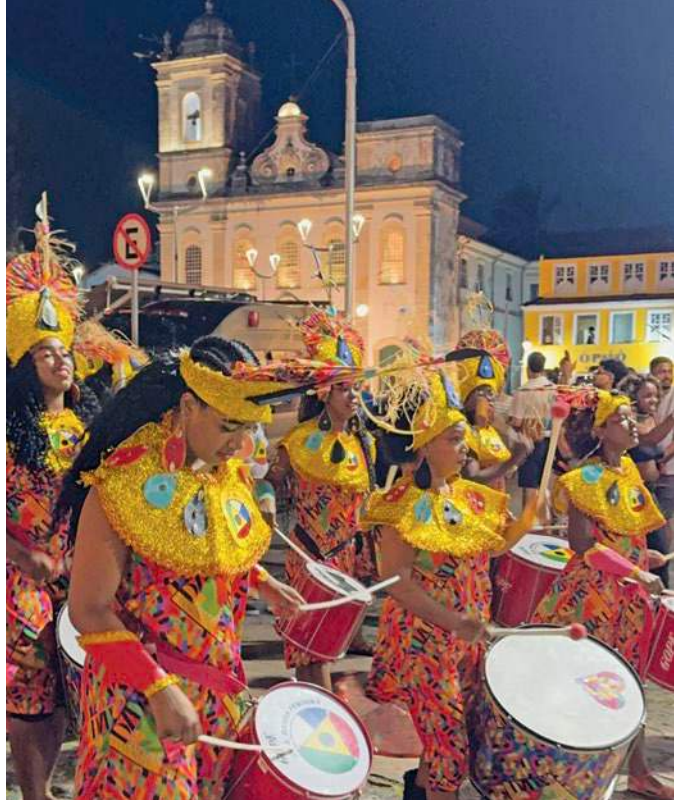
Terça da Benço, Salvador