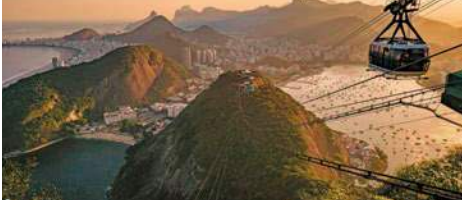
Rio de Janeiro

The National Trust for Historic Preservation is a private, nonprofit membership organization dedicated to saving historic places and revitalizing America's communities. For more information, visit the Trust's website at www.savingplaces.org .