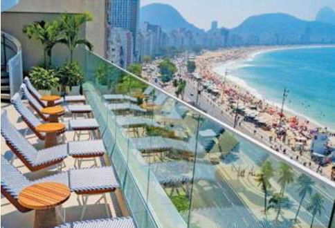
Grand Mercure Rio de Janeiro Copacabana | Rio de Janeiro