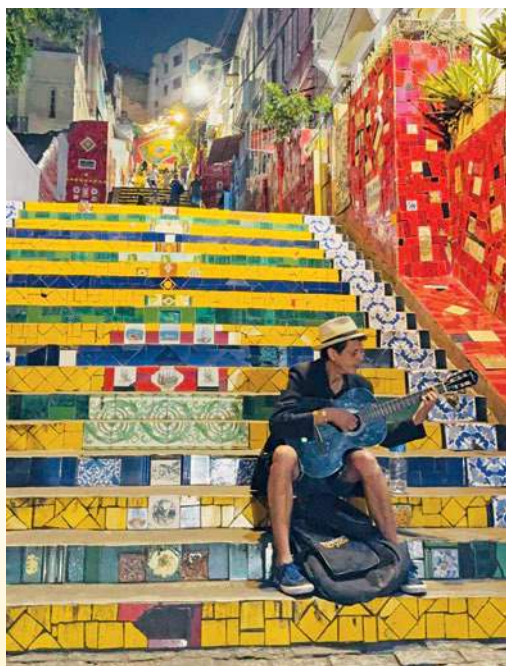
Escadaria Selarón, Rio