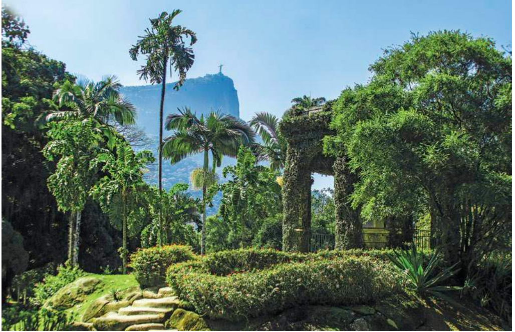
Botanical Garden of Rio de Janeiro