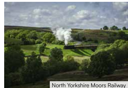
North Yorkshire Moors Railway

The elegant Belton House, cared for by the National Trust, is one of England's finest country houses and a striking example of Gothic Revival architecture. Afterward, we continue to the impressive Belvoir Castle, home to the Dukes of Rutland. A guided tour reveals lavish interiors, fine art and historic treasures before we enjoy a traditional afternoon tea.